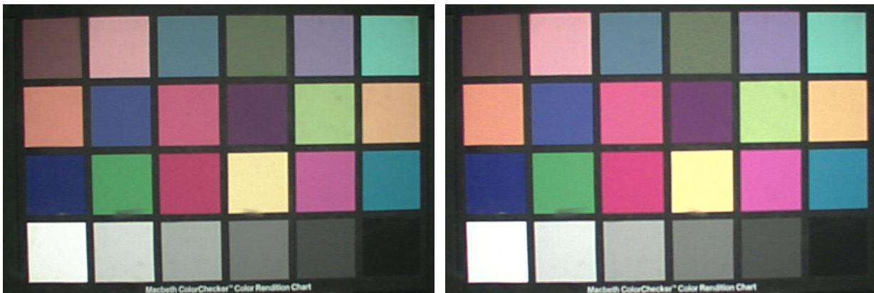
Figure 1 Macbeth chart (a) native performance (b) with matrix settings

After some experiments with the matrix settings, some improvements were forthcoming, but not enough to produce satisfactory pictures. It would be quite difficult to correct the colouring even in a full grading operation.