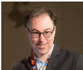
Félix Poulin (CBC/Radio-Canada)

Challenges of transition to IP , Why was NMOS created?, How to find resources, Additional challenges , NMOS as a complete control profile